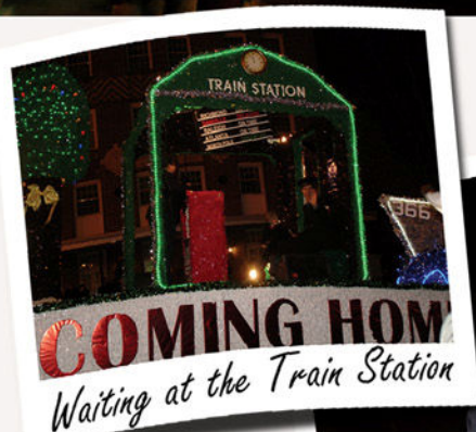
Waiting at the Train Station