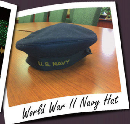
World War II Navy Hat